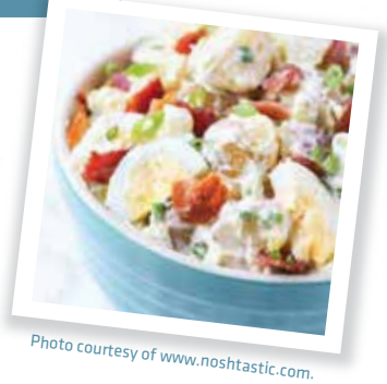
• ½ tsp. garlic powder