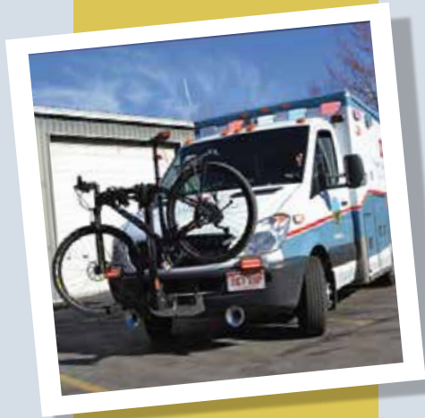
This photo made available on Jan. 23, 2015, by University of Colorado Health, shows a Poudre Valley Hospital ambulance fitted with a bike rack, in Fort Collins, Colo.

By Associated Press Published: Jan 23, 2015 at 11:42 AM PST