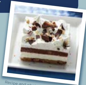
Recipe and photo by Taste of Home.