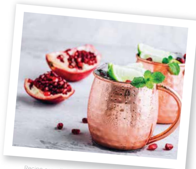
Recipe compliments of www.halfbakedharvest.com

Fill with ice and shake until combined, about 1 minute. Strain into your prepared glass. Top with ginger beer and garnish with apple slices, pomegranate arils, and cinnamon sticks.