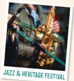
JAZZ & HERITAGE FESTIVAL

NEW ORLEANS, OF COURSE! ALL KINDS OF MUSIC WITH A GREAT LINE UP! APRIL 28-30 & MAY 4-7 JAZZANDHERITAGE.ORG/JAZZ-FEST